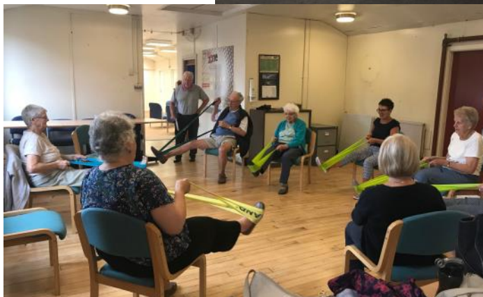
Armchair Aerobics in action